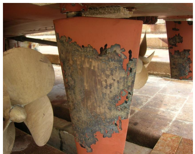
CAVITATION DES HELICES