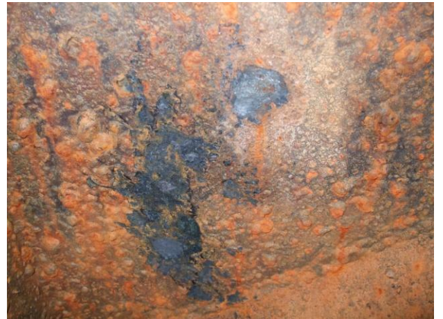
OXYDATION CHANCRE DE ROUILLE = DIMINUTION EPAISSEUR TOLE